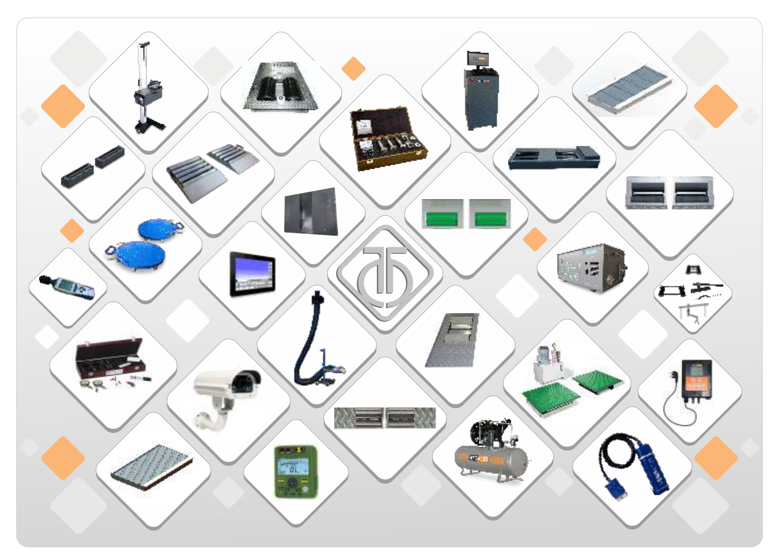
SPEEDOMETER | SIDE SLIP | SUSPENSION | BREAK TESTER | AXEL PLAY DETECTOR | HEADLIGHT AIMING | GAS ANALYZER & SMOKE METER | SOUND LEVEL METER | FREE ROLLER | EXHAUST EXTRACTION SYSTEM

ATS ELGI is a wholly owned subsidiary of ELGi Equipments Limited, a Global Player in the air compressor business.