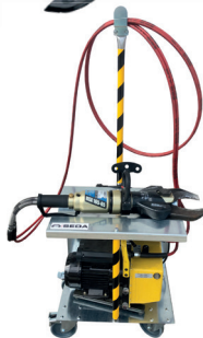
Trolley for hydraulic cutter S-50422

Battery version for RSU160, 180 and 210 available - further details on request.