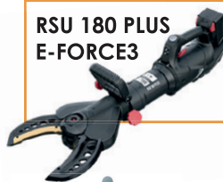
RSU 180 PLUS E-FORCE3

Our optional mobile stand 360° with catalytic converter catchment tray enables easy transport of the cutter and the motor in order to facilitate the usage significantly and prevent any injuries or damages!