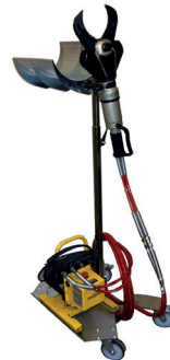
Mobile Stand S-50336

Mobile Stand 360° available as battery and cable version. S-50354-17