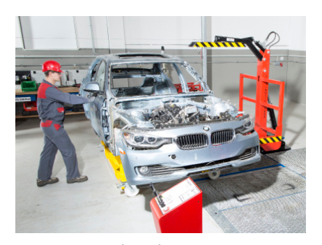
Easy to equip with SEDA vehicle trolley