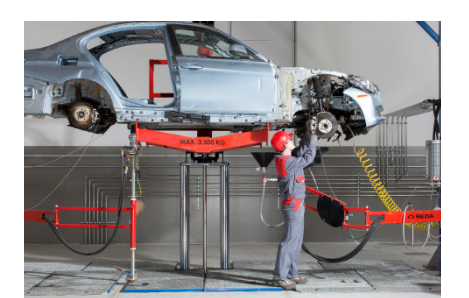
Easy access to the car bottom