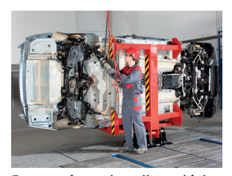
Ergonomic work on the vehicle bottom