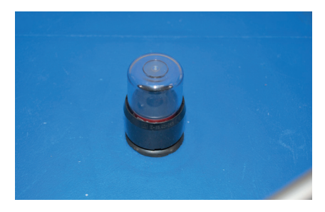
Sight glass for visual control