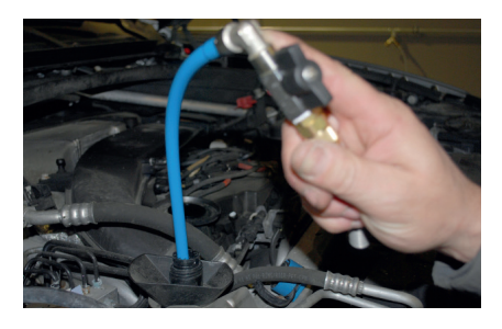
Removal via suction lance into the recovery tank