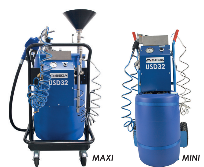
Also available as an EXTENSION SET for all SEDA systems!