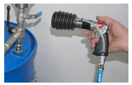
Removal by the drilling machine into the recovery tank